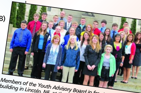
Members of the Youth Advisory Board in front of the Capitol building in Lincoln, NE, at the Youth Capitol day in 2012.