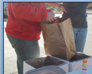
Volunteers collected prescription medications to be properly disposed of on Saturday, September 29th.

The Positive Pressure Coalition, in coordination with the Kearney Elks Lodge, the Buffalo County Sheriff's Office, Good Samaritan Hospital, and Two Rivers Public Health Department, put on another successful Prescription Drug Take Back event on Saturday, September 29th.