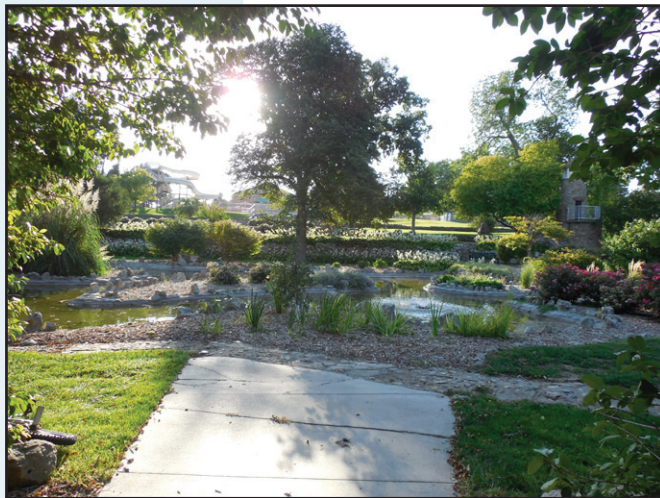
A photo from one of this year's PhotoVoice participants.

strengths and problem areas. Participants are then assigned to take pictures that reflect and express their personal views on those themes. At the end of the program, each student will be asked to select two of their best works for framing and exhibition.