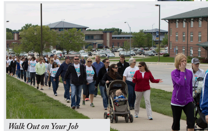
Walk Out on Your Job