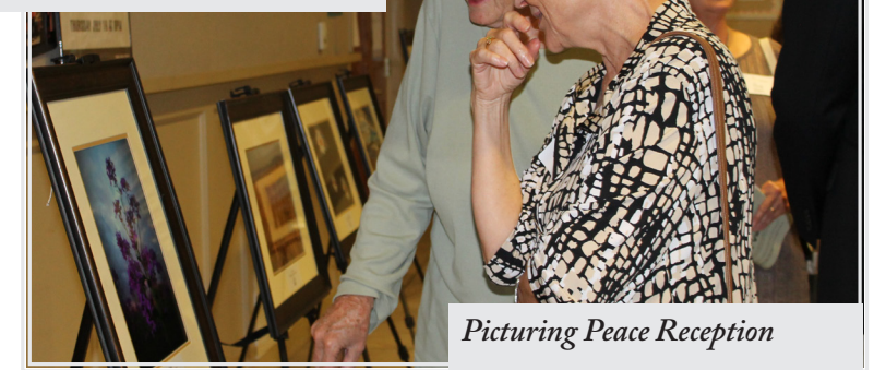
Picturing Peace Reception