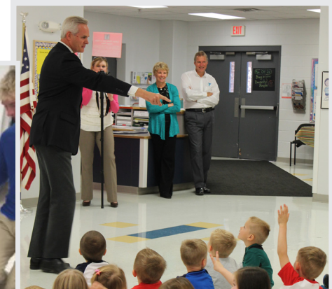
Lt. Governor Foley at YMCA