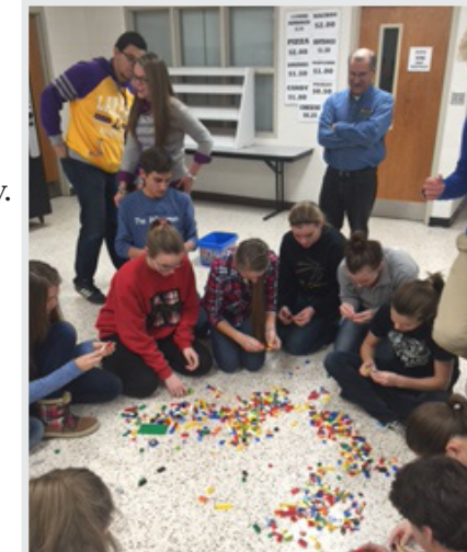
Youth Advisory Board Meeting