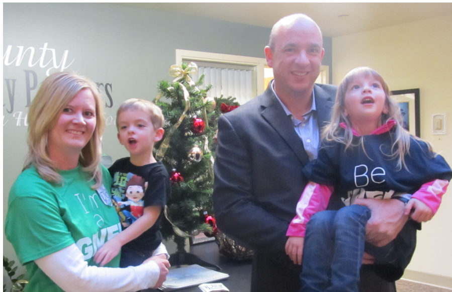
Thank You to our 2015 campaign family! It was a blessing to work with this family!

This year we celebrated 25 years of Walk Out On Your Job, in which, for the first time, Activate Buffalo County engaged the workforce in an event that broke-even financially and they look forward to adding more businesses and volunteers in 2016. Activate Buffalo County also hosted several walk/bike to school days in the spring and fall engaging more families in setting the walking and biking pace in your community.