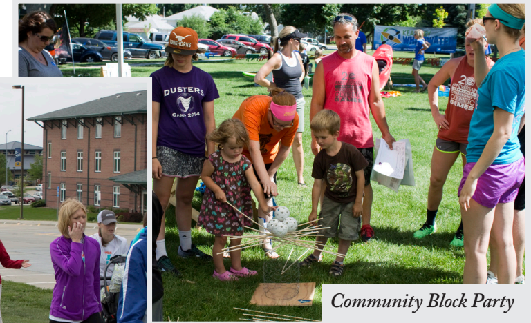
Community Block Party

story building' by launching the 2015 Annual Fund Campaign with a Harmon Park party. Our community is rich in programs and opportunities for families to be active together, which builds resilient families and engages youth. Building on that theme, Positive Pressure launched the "Parents, Take a Stand" blog, highlighting a webinar with Dr. Atri on 'Normal Teenage Behavior'. cont. pg 2