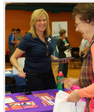
Diabetes Information and Referral Fair