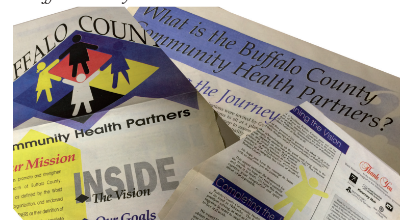
First "Community Report" ran in the Kearney Hub October 12, 1996. The report described the beginning of the Community Partners as a group who wanted to know the health status of Buffalo County. It explained how they decided to answer the question "What are the elements needed to create a healthier Buffalo County?" We continue to work to fulfill the mission set by our leaders

A lot of things have changed since 1996, yet one thing has remained the same, the mission of Community Partners, "to assess, strengthen, and promote health in Buffalo County."