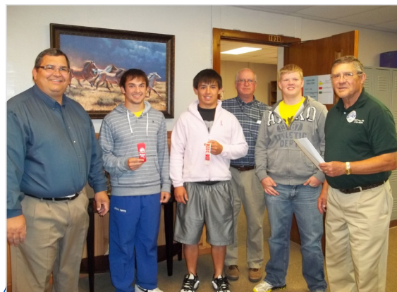
The Summer - Eddyville-Miller YAB celebrated Red Ribbon week with members of the Elks lodge. This campaign focussed on providing tools to teachers.

2016 Annual Youth Summit returns to engage youth in leadership and entrepreneurship.