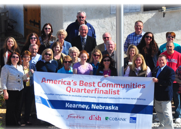
America's Best Community Team Kearney Announcement.